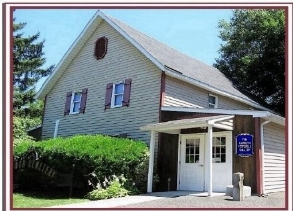
The Fetterolf Gallery

The Main House contains an office, a large research library for local genealogy and history, and six rooms containing local artifacts and memorabilia.