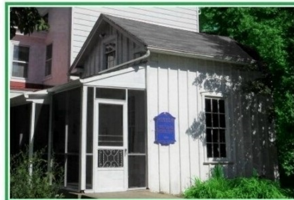
J. M. Lewin Cobbler Shop

Museum Hours Sundays...1 PM to 3 PM Fridays....11 AM to 3 PM Also by Appointment